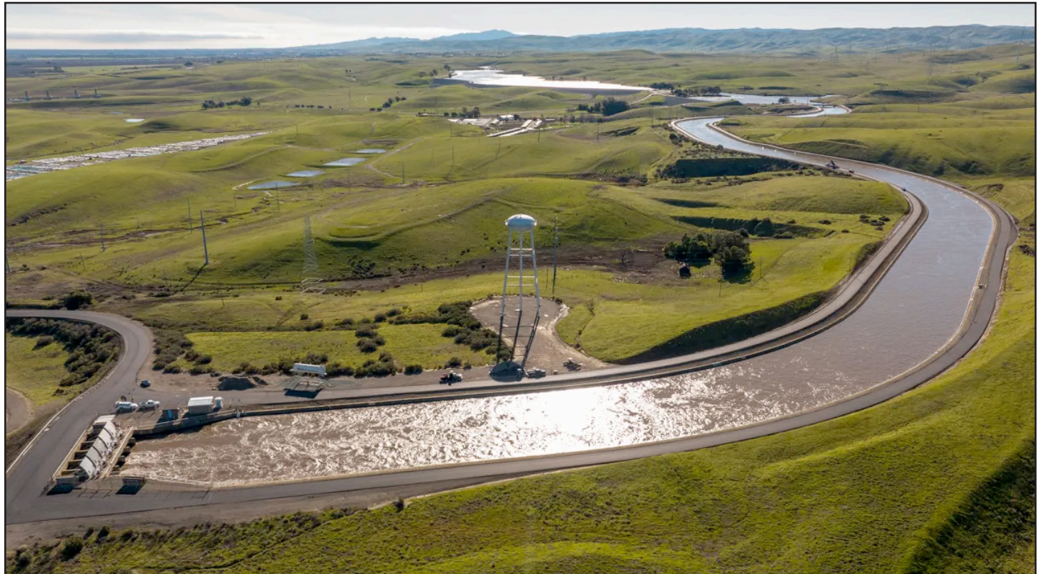
A drone provides a view of water pumped from the Harvey O. Banks Delta Pumping Plant into the California Aqueduct at 9,790 cubic feet per second after January storms. The facility located in Alameda County and lifts water into the California Aqueduct. Jan. 20, 2023.

"As someone who's all in on high-speed rail... all I can think about is, 'what if?' 'What if we