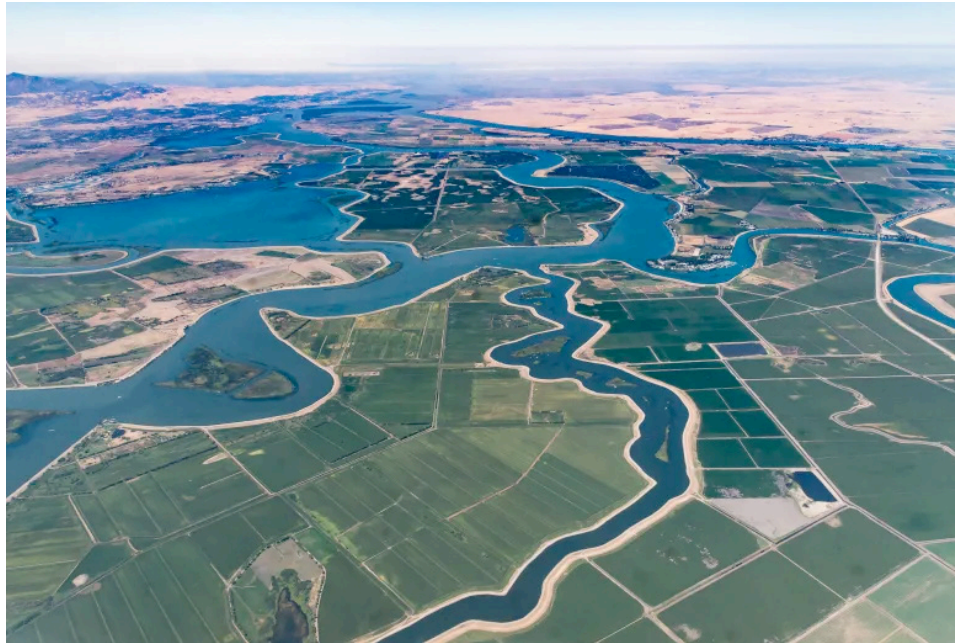
Numerous waterways snake through the delta where the Sacramento River and San Joaquin River meet. Visible in the photo is Bethel Island, Franks Tract State Recreation Area, Mandeville Tip County Park, and Brannan Island State Recreation Area.

Some of these changes would broaden provisions already included in state law. The nine-month limit on environmental litigation, for example, already applies to renewable energy projects, certain housing and even major sports stadiums.